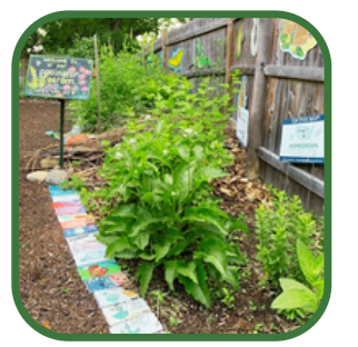
Fowler Branch Library Gardens