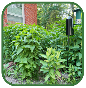
Dept. of Planning & Land Management