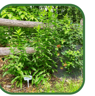
Baker Avenue Boat Launch