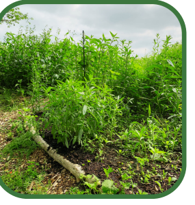
Barrett's Mill Conservation Land (by trailhead)