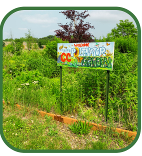
Concord-Carlisle High School Gardens

Questions? Fowler Branch Library 978-318-3350 fowler@concordlibrary.org