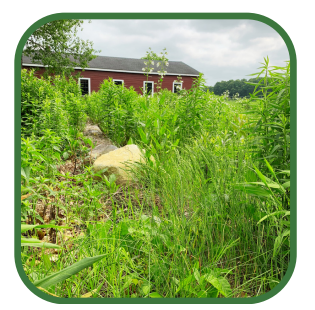
Barrett's Mill Conservation Land (near farmstand)