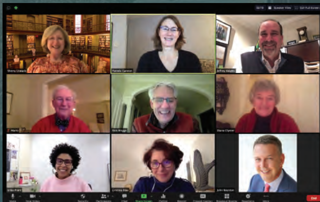
Working on behalf of the Library Corporation doesn't stop, even during a pandemic. The Trustees conducted their meetings via Zoom.