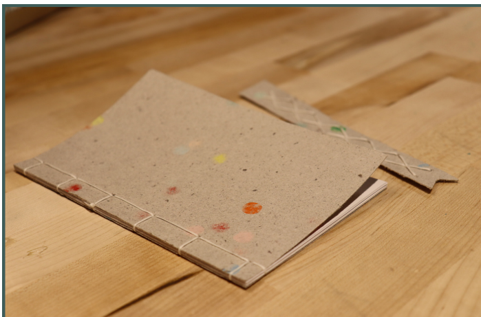
An example journal and bookmark made of recycled paper in the Workshop