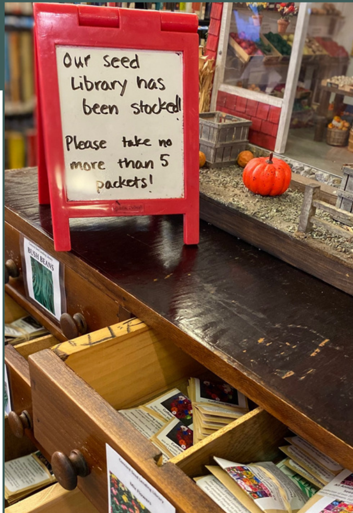
The restocked seed lending library at Fowler