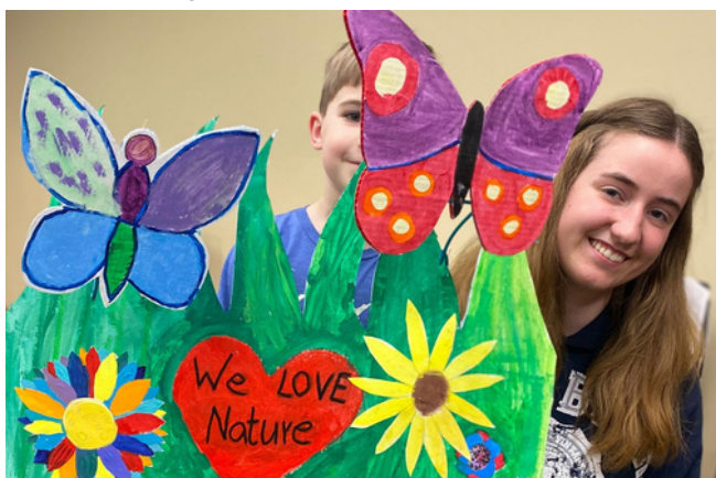
Participants at the Art for All lawn sign workshop with their finished project

Our West Concord community-focused art group Art for All has the pollinator bug now, too. They led three workshops at Fowler to repurpose yard signs into celebrations of nature that also let passersby know that the creator's yard isn't messy -- it's supporting biodiversity!