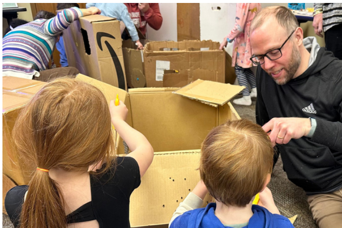
Sustainability Studio participants building their cardboard train in February

We are also partnering with Mothers Out Front to have a monthly "Sustainability Studio" at Fowler - a Saturday storytime dedicated to different ways we can work to help the environment and reduce our waste. In January, we focused on mending and reusing clothing, and in February we built cardboard trains and celebrated public transit. One attendee was inspired after our last program and not only took the train to have a wonderful day out in Belmont with his family but convinced a coworker to start commuting to work together on the train as well!