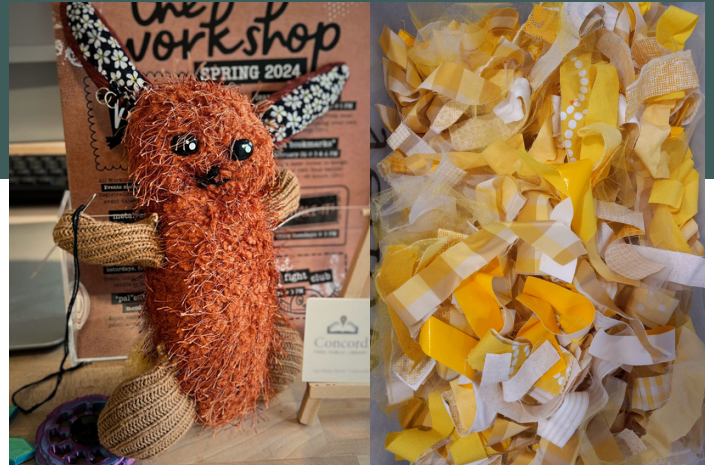
Two uses for recycled fabric in the Workshop: upcycled stuffed animals for our April series (left) and material for our Pride month rag wreath program (right)