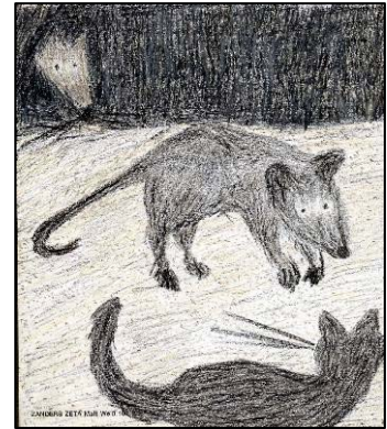
Cat and Mouse