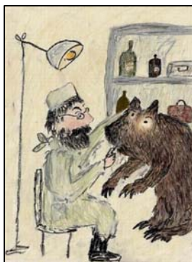
At the Appointment With the Country Doctor