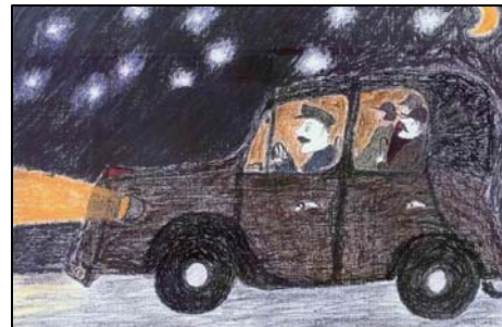
Going to the Opera