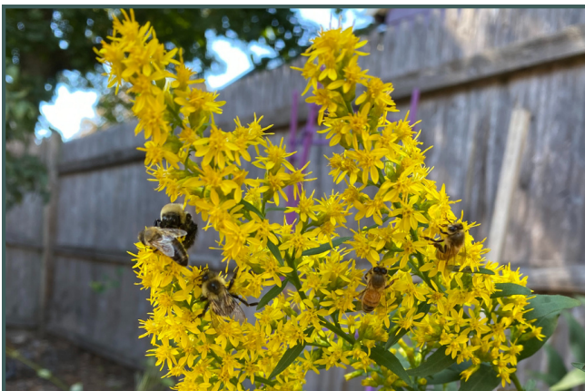
Pollinator friends enjoying the garden at the Fowler Library.

Recent highlights of our efforts: the CFPL Corporation contracting with GreenerU to identify options for decarbonization; the Library Green Team being well on path to certification with the Sustainable Libraries Initiative; and creating new partnerships and programs for our upcoming fifth annual CREW Climate Preparedness Week!