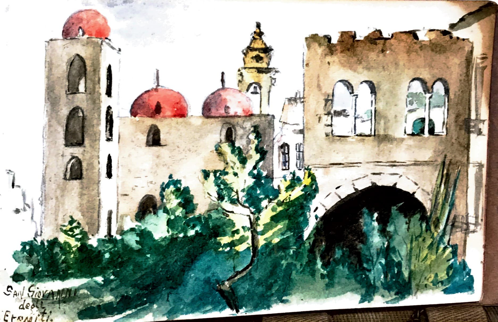
SAN GIOVANNI degli Eremiti.