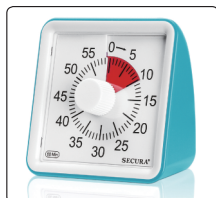
Secura 60-Minute Visual Timer