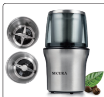
Secura Electric Coffee and Spice Grinder