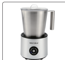
Secura Automatic Milk Frother