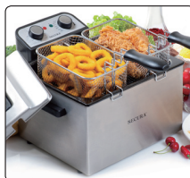
Secura Triple Basket Electric Deep Fryer