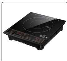
Duxtop Portable 1800W Induction Cooktop