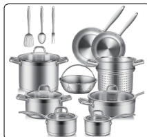
Duxtop Whole-Clad Tri-Ply Premium Cookware