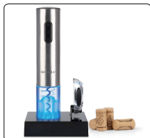
Secura Electric Wine Opener