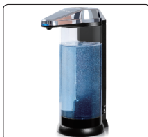
Secura Electric Soap Dispenser