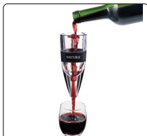
Secura Premium Wine Aerator