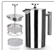
Secura French Press Coffee Maker