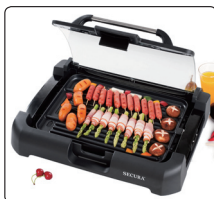
Secura 1700W Electric 2-in-1 Grill Griddle