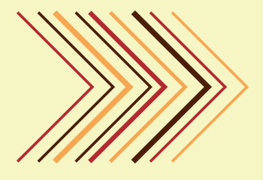
CFPL ART TOUR Selected Artwork from the William Munroe Special Collections

The William Munroe Special Collections have grown into the most comprehensive archive of primary and secondary source material related to Concord history, life, landscape, literature, people, and influence from 1635 to the present day. Special Collections officially began with the founding of the Concord Free Public Library in 1873 and the far-sighted request of the Library Committee for citizens to donate material of local significance to ensure "an appropriate gift of the present generation to posterity."